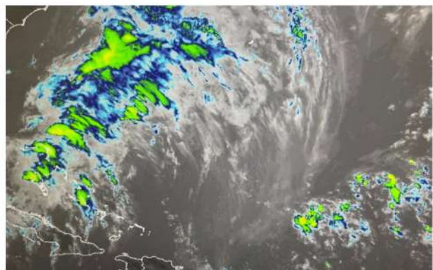
Thermal satellite imagery monitoring activity over TCI & Atlantic basin